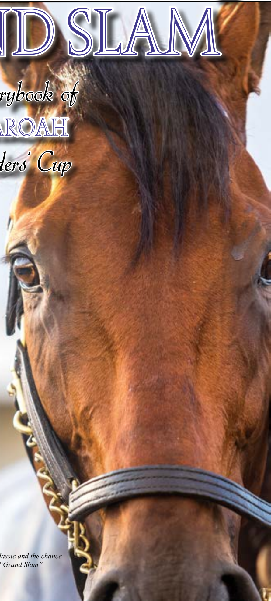
Photo this page: American Pharoah eyes the Breeders' Cup Classic and the chance at history in becoming the first horse to win the newly minted "Grand Slam"

O n October 30th and 31st, the the bluegrass of Lexington, Kentucky and historic Keeneland Racecourse played host to the 2015 Breeders' Cup World Championships. The especially memorable weekend was highlighted by the presence of American Pharoah and the first opportunity for a Triple Crown winner to compete in the event. With American Pharoah targeting a start in the $5,000,000 Breeders' Cup Classic, the racing world awaited the possibility that the 12th Triple Crown winner could take the Classic and become the first horse to capture what was billed as the "Grand Slam." This is a photographic journey American Pharoah's quest and the rest of first Breeders' Cup ever held in the hometown of American Thoroughbred racing.