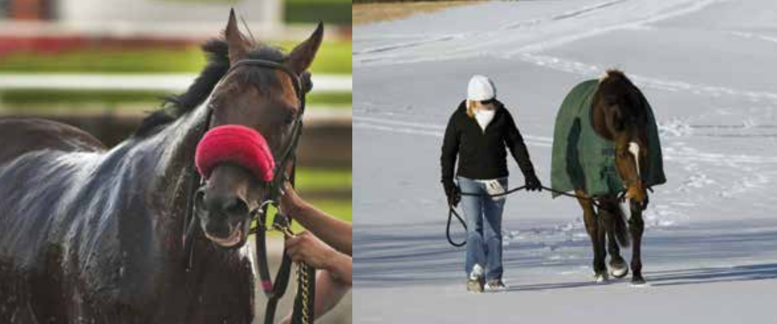
Where can I get a copy? The "Fast" Horse Resource is distributed to 45 States (& counting.) It is available for FREE in many Western Stores, Trailer Dealers and other Retailers across the US. Check out the on-line digital version at www.thehorseresource.net. Our digital version allows us to reach thousands more readers each month! You can also find a copy at many equine events. Contact us to have your favorite location become a distributor or to subscribe.